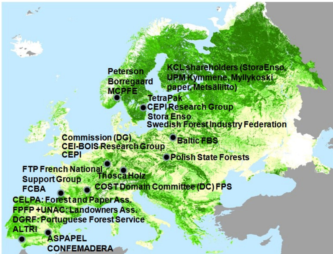
Figure 2. Roadshow meetings held during EFORWOOD

In addition to the European stakeholder organisations, EFORWOOD was presented and discussed with 7 American organisations to get a non-European view of the approach taken by EFORWOOD. See PD0.1.8 for further details of these meetings.