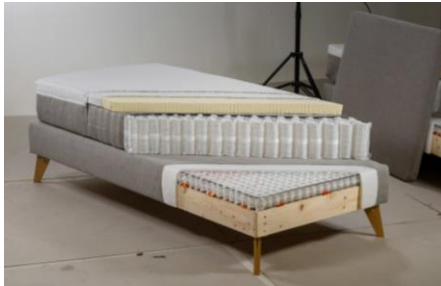
Veldeman Group (Target groups, Offer, Channels)