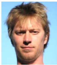
Pavli Pori (Slovenia)

Hydrothermal deposition of TiO 2 on spruce wood surfaces at different water contents in samples pavli.pori@gmail.com