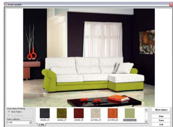
Virtual dressing with different fabrics and/or finishing

➤ The addition of all these improvements has been possible due to the continuous interaction between AIDIMA and its clients, the wood and furniture manufacturers.